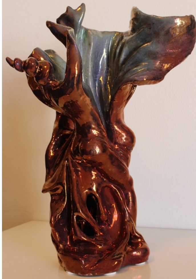
To perform a dance h 43

An intensive expressive research has led the artist to look beyond the image and appearance of things. The result is evident in her ceramics which shows an evocative power of colours and abstract shapes. The intense colours, the peculiar geometric patterns and the positive feel of her works invite the viewer to a voyage through the realm of dream, a lunar landscape, thus engendering a desire for escape from everyday life towards a better world.