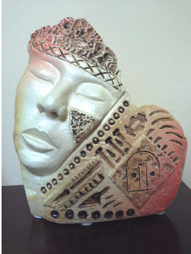
Scraps, 20 x h 30

An intensive expressive research has led the artist to look beyond the image and appearance of things. The result is evident in her ceramics which shows an evocative power of colours and abstract shapes. The intense colours, the peculiar geometric patterns and the positive feel of her works invite the viewer to a voyage through the realm of dream, a lunar landscape, thus engendering a desire for escape from everyday life towards a better world.