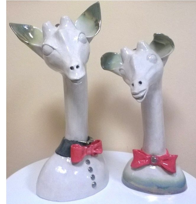
Metamorphosis, ceramics 40 x h 45